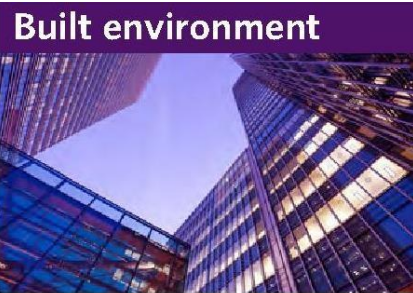
Built environment The circular economy opportunities in the built environment will add £3-5bn to GDP by 2036.