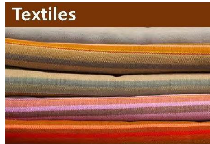
Textiles The circular economy opportunities in the textiles sector are over £1bn by 2036.