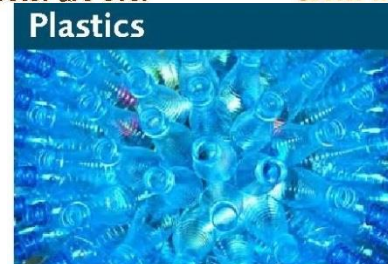
Plastics The circular economy opportunities in the plastics sector will be at least £200m by 2036.