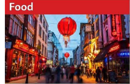
Food The circular economy opportunities in the food sector will add £2-4bn to GDP by 2036.