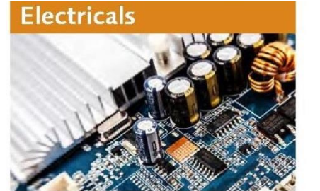
Electricals The circular economy opportunities in the electrical and electronic equipment sector will be at least £900m by 2036.